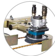
Standard hydraulic drive motor